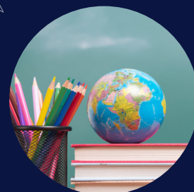
A Principal Teacher of Languages

A Head of Faculty for Modern Languages in a secondary school in Aberdeen with extensive experience teaching French and Spanish across the full secondary range, including Advanced Higher, the teacher holds the GTCS Professional Recognition Award for Leading Learning in Modern Languages and an MEd from the University of Glasgow, alongside postgraduate qualifications in Modern Languages and Inclusive Education. Their career has combined classroom practice with educational leadership, curriculum development, and whole-school improvement. They also contribute to national curriculum development through their role as a member of the Modern Languages Core Group of the Curriculum Improvement Cycle currently run by Education Scotland. They are particularly interested in language learning as a tool for equity, cultural understanding, and learner confidence, and in the evolving future of Modern Languages education in Scotland.